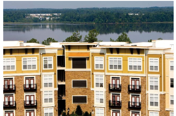
Weston Lakeside 1017 Umstead Hollow Cary, NC 27513 map